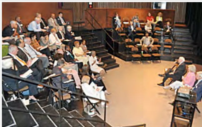
Senior members of the American Association of Community Colleges discussed the future of community colleges with attendees of the northern California stop of the Listening Tour.

T he American Association of Community Colleges (AACC) held their northern California stop of their national Listening Tour at DVC on Thursday, July 21, 2011, in the Arena Theater. The purpose of these regional meetings is for the national organization to gain insights about pressing issues confronting community colleges and their more than 12 million students.